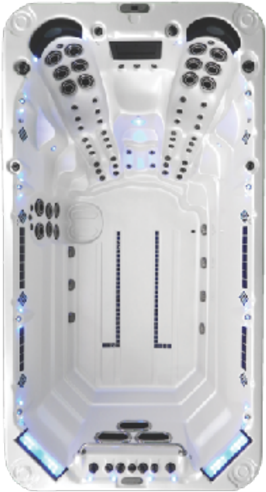
Shown with the following options: (2) 18" LED Spill-over waterfalls (24) LED Light system Navy tile with Midnight Blue waterline accent tile