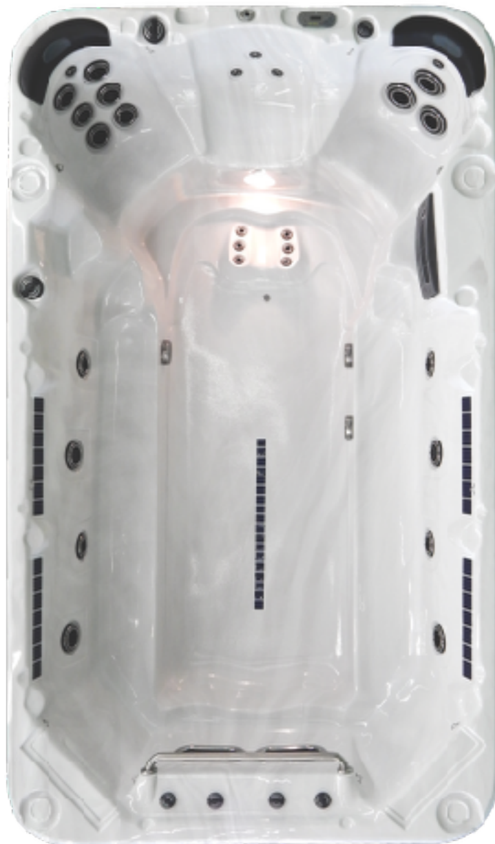
Shown with the following options: Navy tile